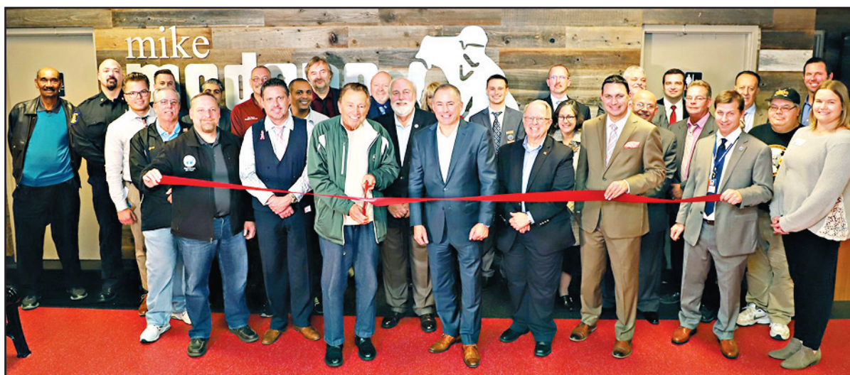
Westland officials and community members celebrate the renovations to the Mike Modano Ice Arena with an official ribbon cutting.

Since 2010, the arena has seen more than $1.75 million in upgrades including: 2010 - new compressors, dehumidifier and cooling tower; 2015 -new LED lighting installed over arena ice surface, remodeled Breakaway Café, free WiFi, new heating units for the spectator area and new